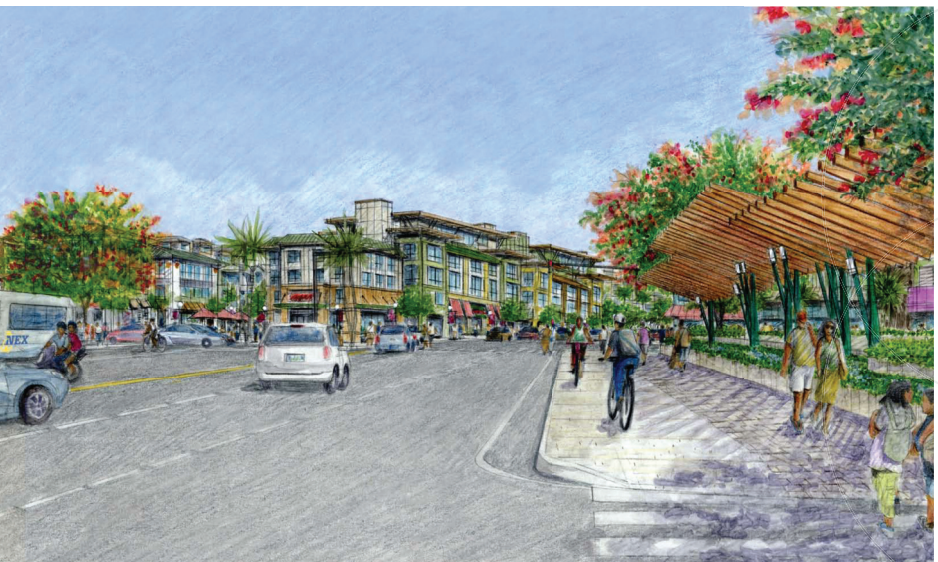
Renderings (for Illustrative purposes only) are courtesy of the Department of Planning and Permitting.

has said that they may consider relocating their facilities to the main Joint Base Pearl Harbor-Hickam (JBPHH) installation, potentially freeing up a prime stretch of land within a half-mile of the rail stop for multi-family residential use with neighborhood commercial, retail and dining options.